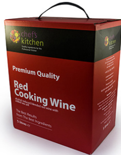
ACHE49090 Red Wine 5ltr €10.95