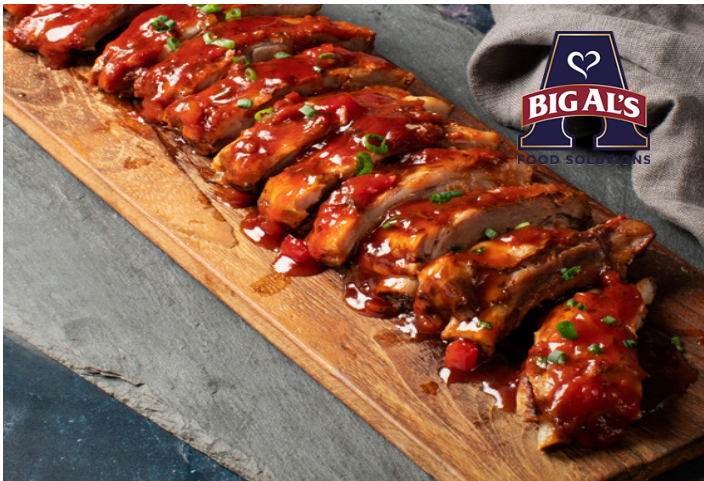
FGOL4280 Pork Rib Rack 10 x 1040g €110.00