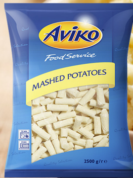
FAVI4319 Mashed Potato 4 x 2.5kg €21.00