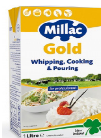
CLAK5030 Millac Gold x12 €31.00