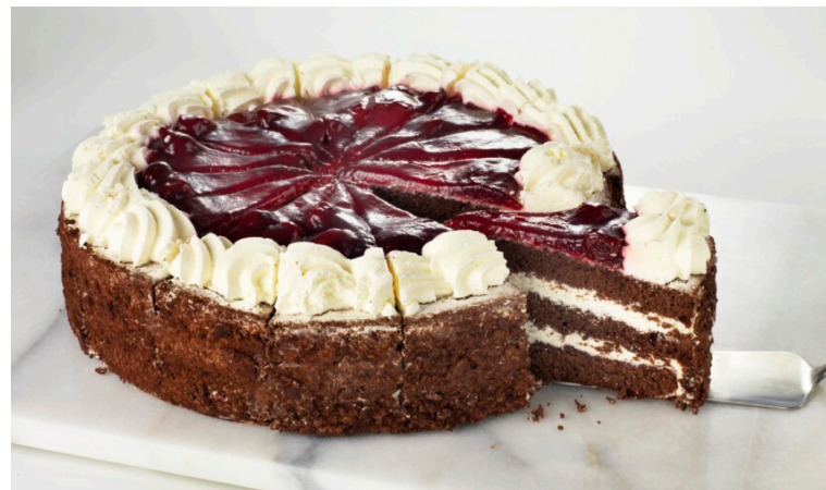
FPAT4893 Black Forest Gateau 14PTN €17.60