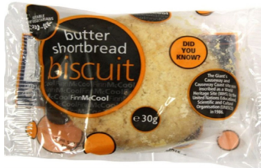
FFAR4710 Shortbread Cookies x 36 €21.60