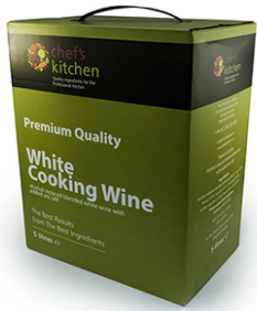
ACHE49089 White Wine 5ltr €10.95