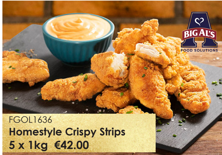
FGOL1636 Homestyle Crispy Strips 5 x 1kg €42.00