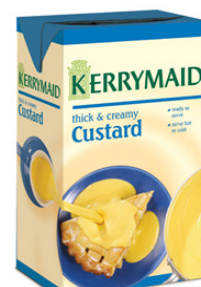
CKER5071 Custard 12 x 1ltr €27.50