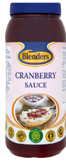
CBLE49076 Cranberry Sauce 2x2.5kg € 30.95