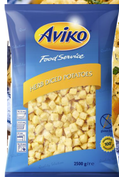
FAVI4355 Diced Potato 4 x 2.5kg €19.95