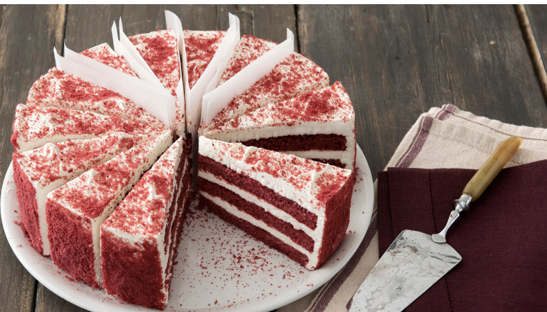
FPAT4860 Red Velvet Gateau 12PTN €19.95