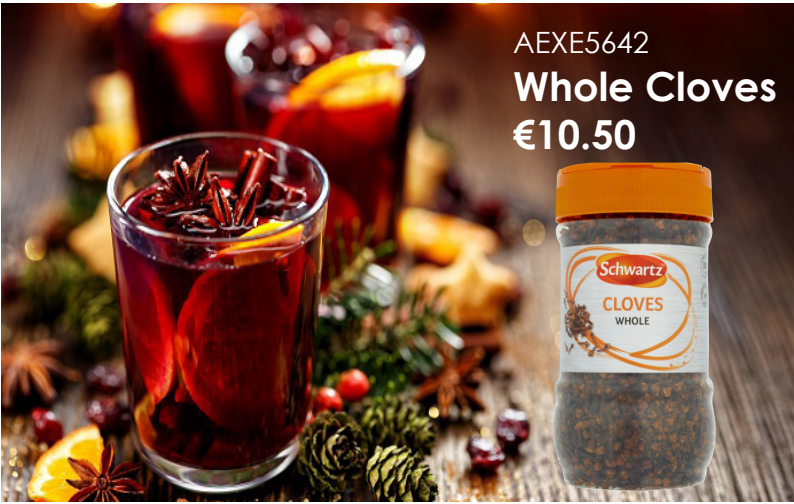
AEXE5642 Whole Cloves €10.50