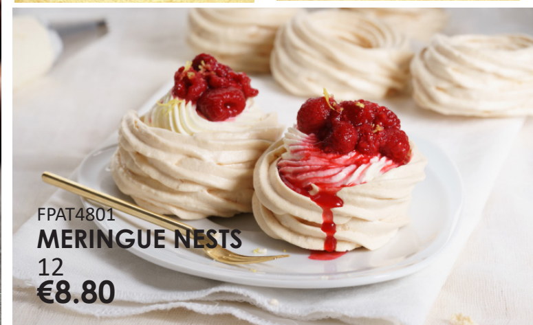
FPAT4801 MERINGUE NESTS 12 €8.80