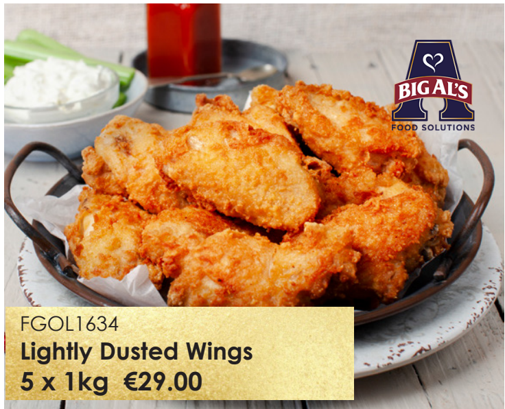
FGOL1634 Lightly Dusted Wings 5 x 1kg €29.00