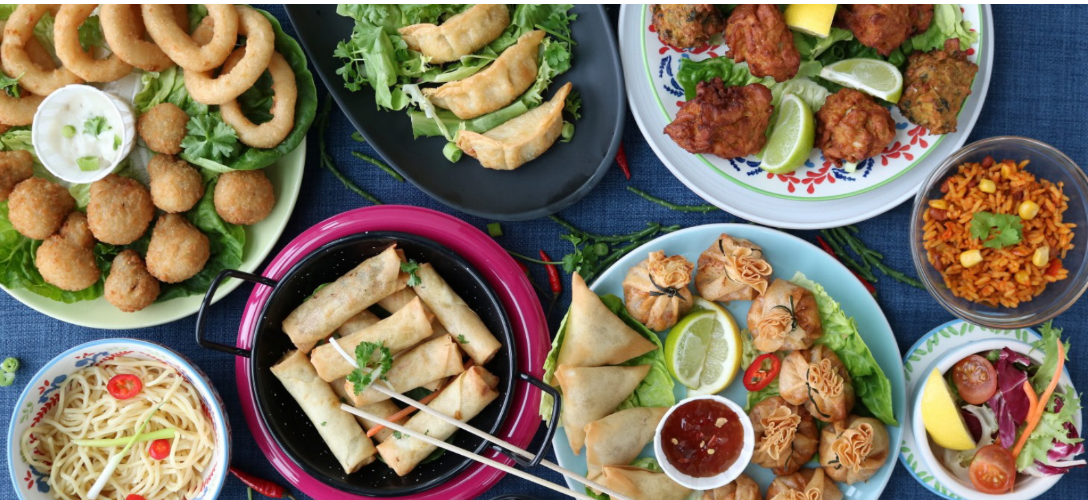
FPAN4708 Onion Bhaji 200g €2.99