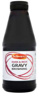
AEXE5697 Gravy Browning 950ml € 6.95