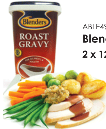
ABLE4929 Blenders Gravy 2 x 12ltr €22.50