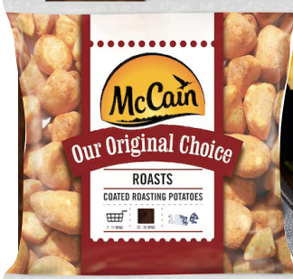
FMCC4352 Roast Potato 4 x 2.27kg €19.95